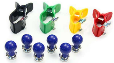
Clamps and Bulbs *