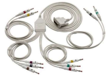
10 Lead patient cable

* Accessories shown in the brochure may no be a part of standard configuration